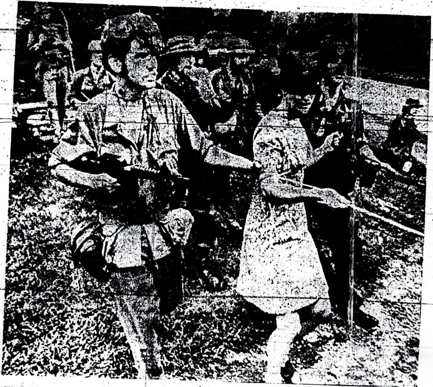
'SEARCH AND DESTROY' exercise is staged in Harding, N.J., by participants in a weekend Vietnam Veterans March Against the War from Bernardsville, N.J., to Valley Forge State Park.